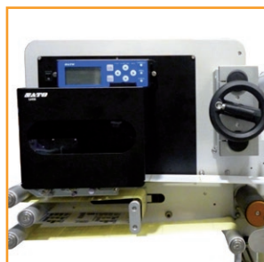
Thermal transfer printers